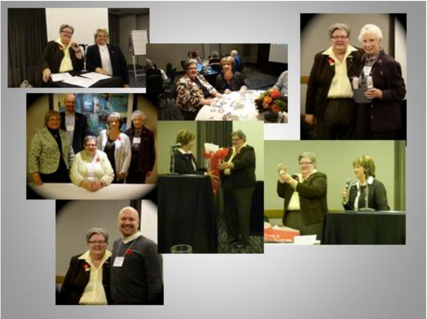
These are some candid shots of the current CDJA executive. Those who were leaving received high praise for all their years of dedication and hard work on behalf of the organization.